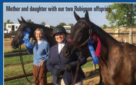
Mother and daughter with our two Rubignon offspring.