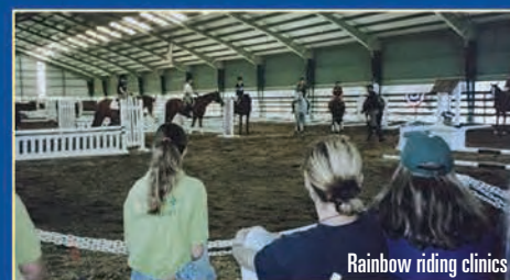
Rainbow riding clinics