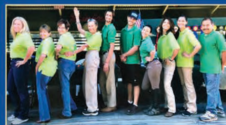
Team Rainbow who helped at last years Inspections - it became a happy memory for everyone attending.

Rainbow Equus Meadows, continued on pg 16