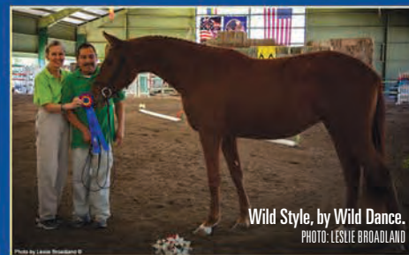
Wild Style, by Wild Dance. PHOTO: LESLIE BROADLAND